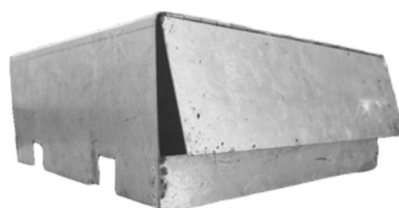
Easy Pizza Oven Square